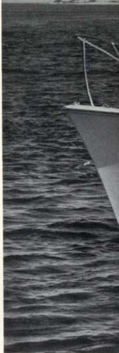
The Hatteras-34, like the