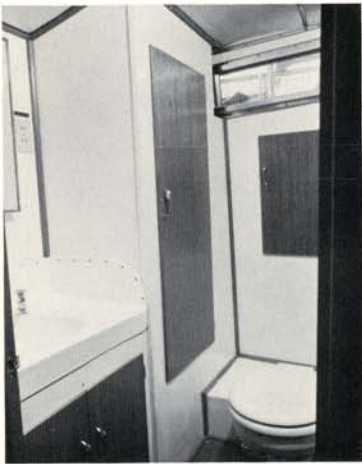
Toilet with lavatory, medicine cabinet with mirror. Towel bar. Paper holder. Full size locker.