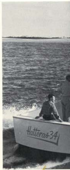
Smooth riding and easy worthy and safe, thanks