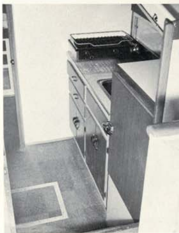
Roomy galley has plenty of storage space. 8½ cu. ft. ice box. Stove. Stainless steel sink.