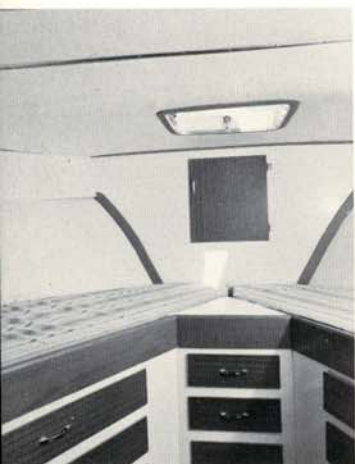
Forward cabin, privacy for the skipper and his lady. Full length clothes locker. Plenty of drawers. Poly foam mattresses.