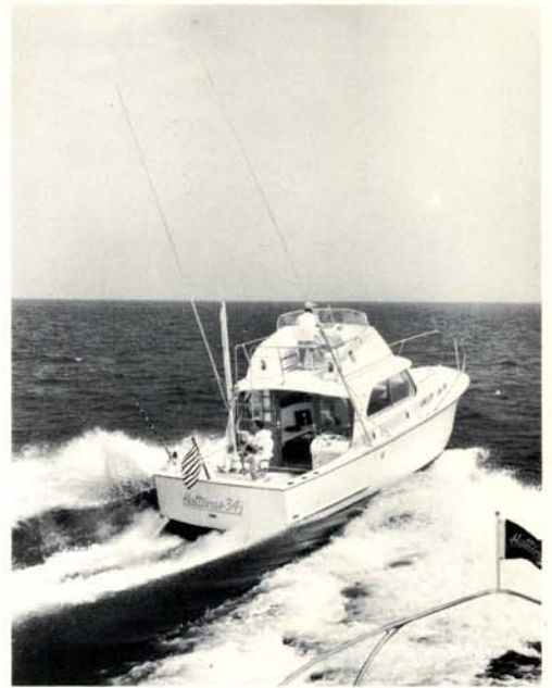
Arrive early and return quickly to fishing grounds.