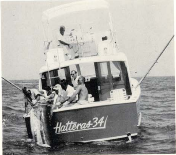
Catch the big ones with a Hatteras.

Incorporated in the Deluxe Sportfisherman: a streamlined bow rail; a curved sectional lounge on the port side of the deckhouse and a bar with an automatic ice machine on the starboard side at the chart deck bulkhead; a shower, hot water heater, water pressure system, 3-burner stove with oven; muffler; as well as cockpit controls.