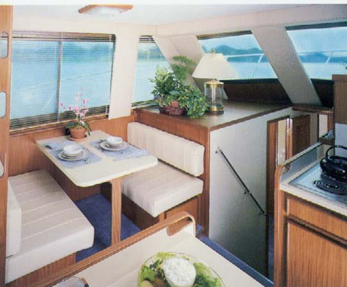
The deckhouse galley arrangement includes a convenient dinette that seats four and offers storage space under the seats.