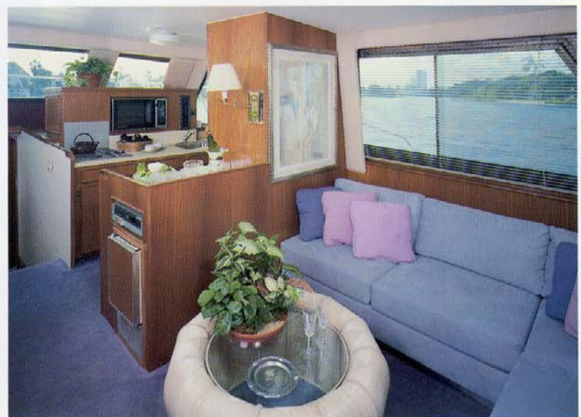
The optional deckhouse galley puts at your convenience a microwave/convection oven, a Jenn-Air® range, a large refrigerator/freezer with ice-maker, and room for an optional compact under-the-counter dishwasher. A spacious built-in lounge is also available.