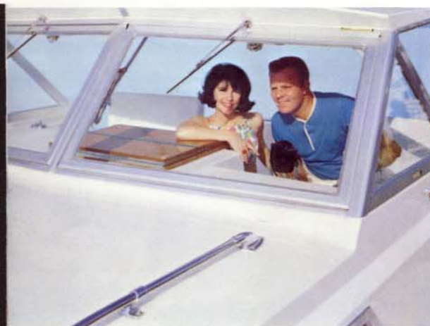
Optional companion seat on the Hatteras 28' Cruiser makes possible conversation and companionship for the Captain as he operates the boat. Factory installed.

The Hatteras is so much easier to maintain because of its one-piece fiberglass hull and fiberglass superstructure. No seams, no joints, no loose fastenings. Rust, dry rot, caulking and sanding are eliminated. Paint for appearance, if you want to, but you don't have to paint for protection.