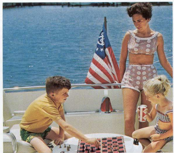
This shows the spacious roomy cockpit, the control station and the all-around view for the helmsman. The companion seat is optional.