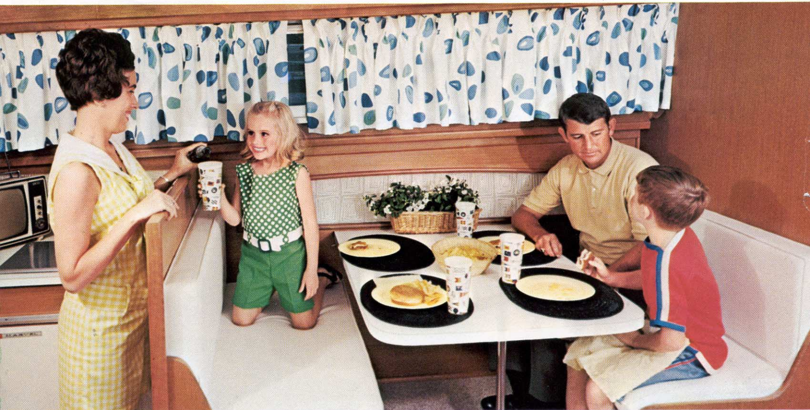
Four persons can be comfortably seated in the dinette which is just arm's length away from the galley. There is 6\frac{1}{2} cu. ft. of storage space outboard with sliding panels.