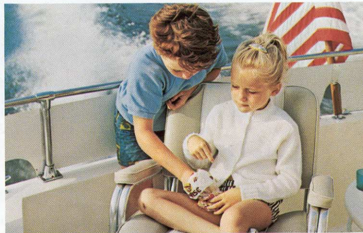
These photos show the advantages of the roomy deep cockpit.

It has a deep cockpit to make it safer for children. And the cockpit has a built-in step to the cat walk on both port and starboard.