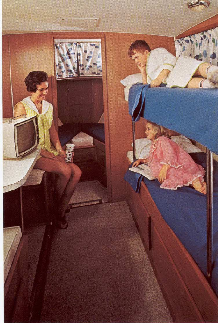
The lounge converts to an upper and lower berth. There is 15 cu. ft. of storage space in the 2 drawers in the base of the lounge and in drawers in the dinette seats.

This floor plan (includes some optionals) shows exactly what you get for comfortable living.