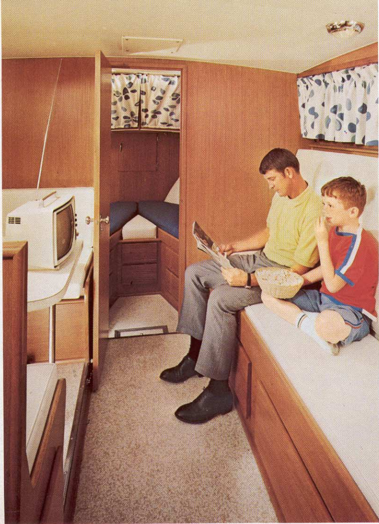
The deckhouse has a convertible lounge opposite the dinette. Head room is 6'3". Screened sliding windows. (Note opened door that closes to provide privacy between bow stateroom and deckhouse.)