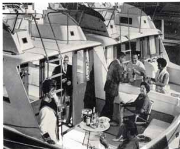
A 34 Sedan and 34 Sports Cruiser side by side for cocktails.

Bridge on the 34 Sedan has a comfortable swivel chair for the helmsman and adjacent seating space for youngsters who want to act as lookouts or observe how easy it is to handle the husky boat.