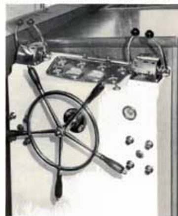
Optional dual control in the Pilot House.

There's a 10 cu. ft. refrigerator with freezer in the galley (just a step down from salon). It has a stainless steel sink with hot and cold pressure water; a 3-burner stove with oven; two 110-volt outlets.