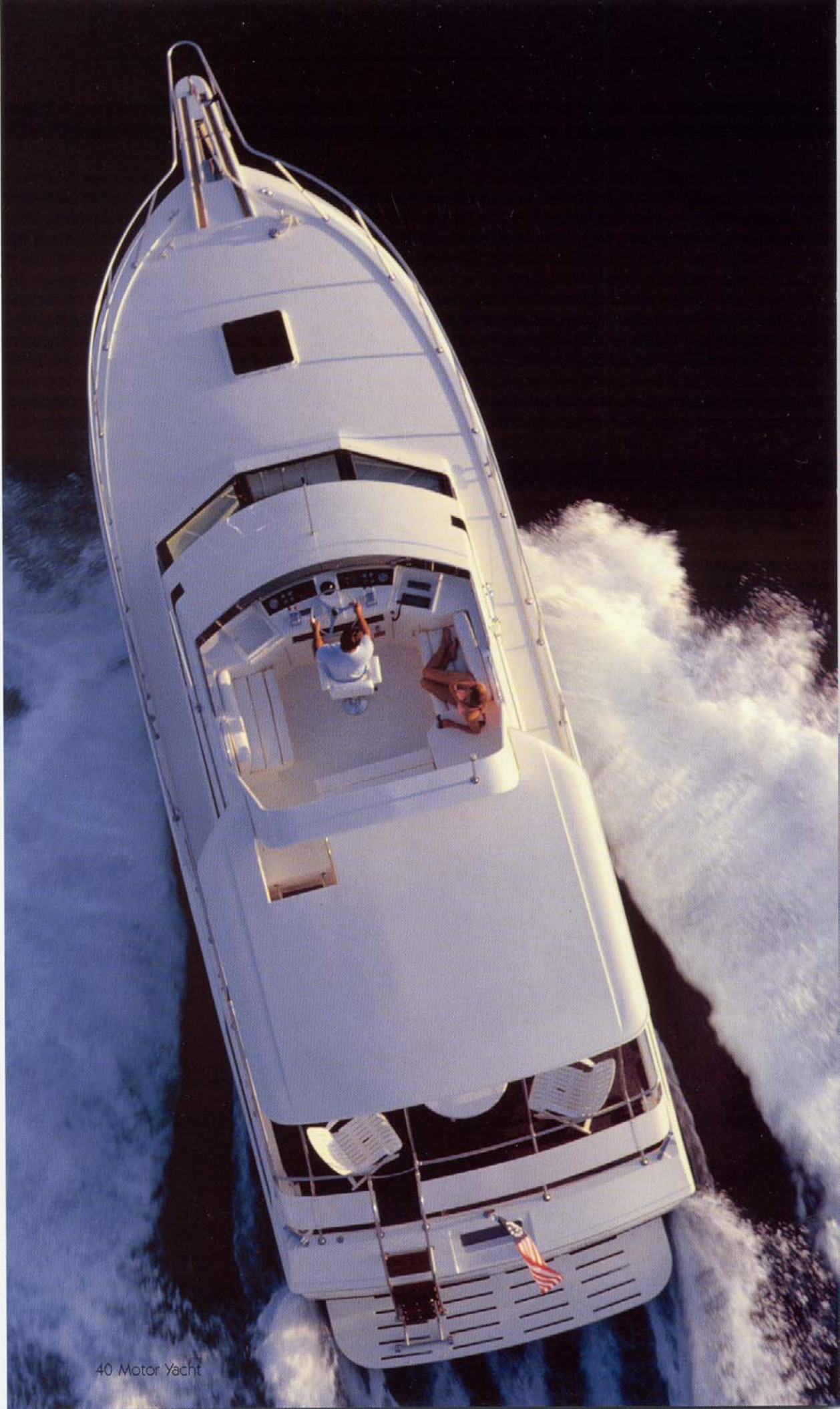
40 Motor Yacht

They are, quite clearly, yachts of superior class and quality. They are convincing proof that the substance and style you've come to expect in your daily life is now also available to you on weekends.