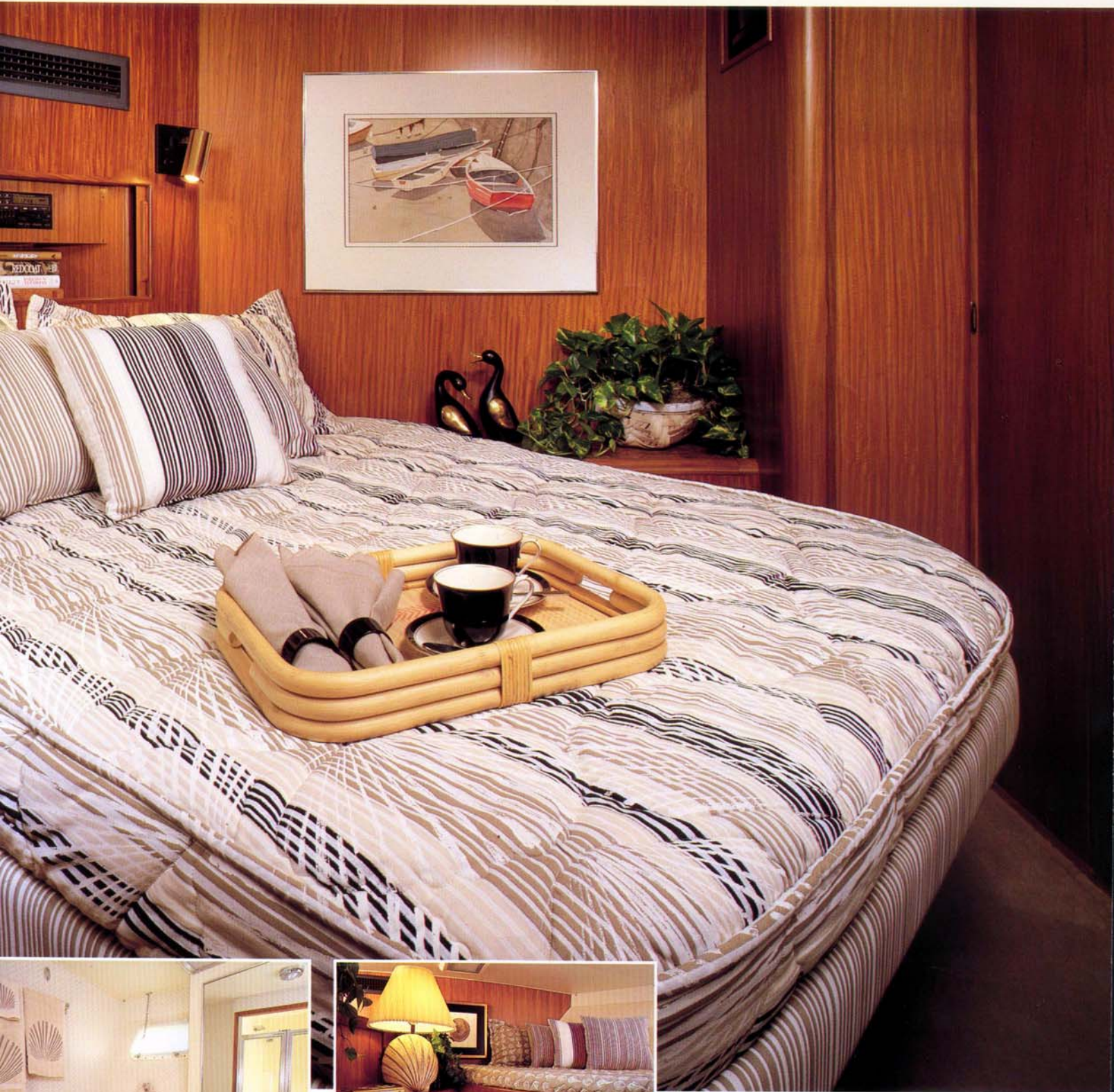
The master stateroom (above) is located amidship. The queen-size bed is placed diagonally, for even more floor space.