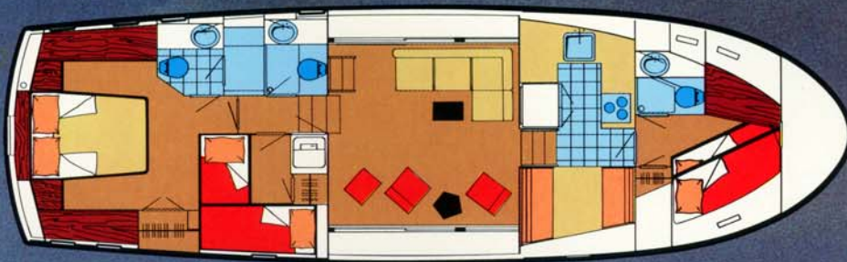
Forty Eight Motor Yacht—Standard Arrangement

As a cruising yachtsman, you will appreciate the engine room's five-and-a-half feet of headroom which assures easy, all-around access to the engines, the twin banks of heavy-duty batteries with automatic charger, and the standard 15 kw generator. The Forty Eights' electrical system includes transformer-connected 120/240 volt shorelines and automatic ground fault protection on appropriate circuits.