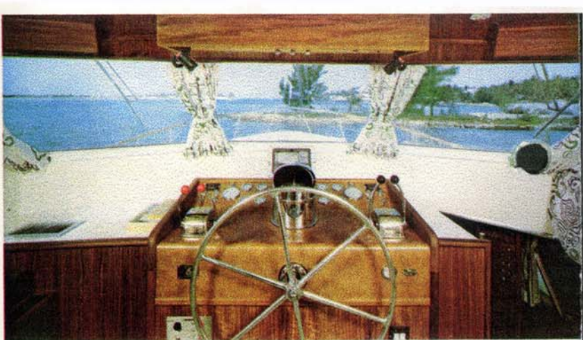
Control station in salon has all necessary instruments and switches, aircraft type chart lights, Constellation compass with lights, dual lever controls with hydraulic steering and adjustable helmsman's seat. The windshield and side windows afford all-around viewing. There are 3 windshield wipers and 3 windshield washers.

The bow stateroom has upper and lower bunks, and sleeps fore-and-aft. It has a built-in chest of drawers; a large hanging locker. And the spacious rope locker provides additional storage