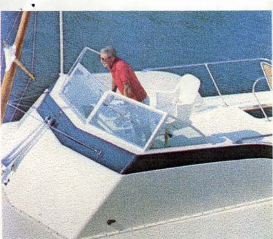
Optional flying bridge is a complete control station with dual controls. It has comfortable seats for companions to the skipper and has a helmsman's chair.