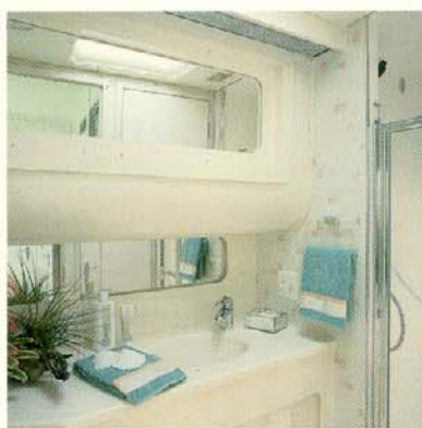
Because the forward head has two entry doors, it functions as a private head with shower for the bow stateroom. Or, from the atrium companionway, it can also be used as a day head.

Your guests will enjoy the spaciousness and privacy of the V.I.P. stateroom with its own private head — complete with a man-sized stall shower. Every detail has been skillfully incorporated for your guests' comfort.