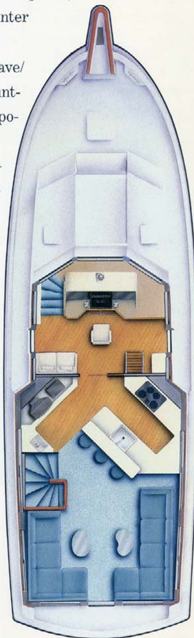
This main-deck floor plan gives you a feeling for the livability of this motor yacht: the large amount of conversational seating in the salon and the private wheelhouse forward with a private stairway to guest quarters.