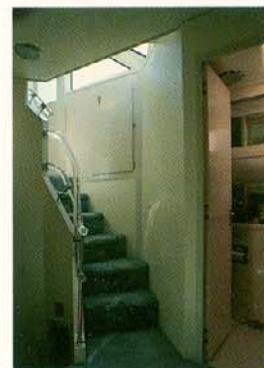
A curved, open stairwell forward from the wheelhouse becomes an atrium for the guest staterooms, day head and washer/dryer closet.

The moment is right. The new Hatteras 54ED is right, for you and your family. Call your Hatteras dealer for an appointment with the good life!