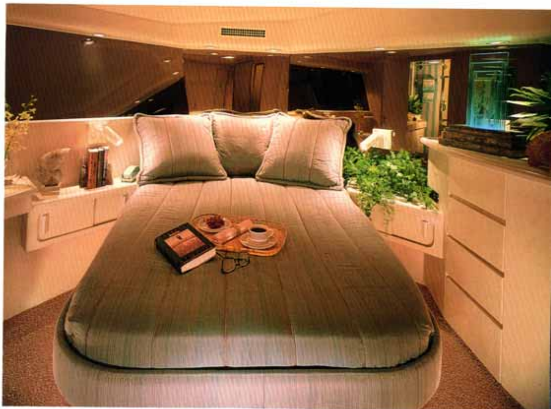
Upper Right The V.I.P. Guest State- room is mid-ship, and could be your master stateroom at a flip of the coin. It's equally luxu- rious, and also features a walk-around queen-size berth (a twin berth ar- rangement is optional), night stands, full cedar- lined hanging locker, and adjacent private head with shower. The washer/ dryer is located in a companionway locker.