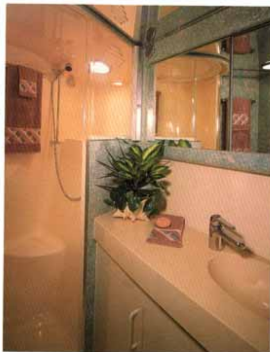
It's hard to believe this is the head on a fishing machine, but this is a Hatteras, remember. All three heads have full-size stall showers, in fact. This is the ultimate in luxury, with tasteful laminates and excellent indirect lighting.