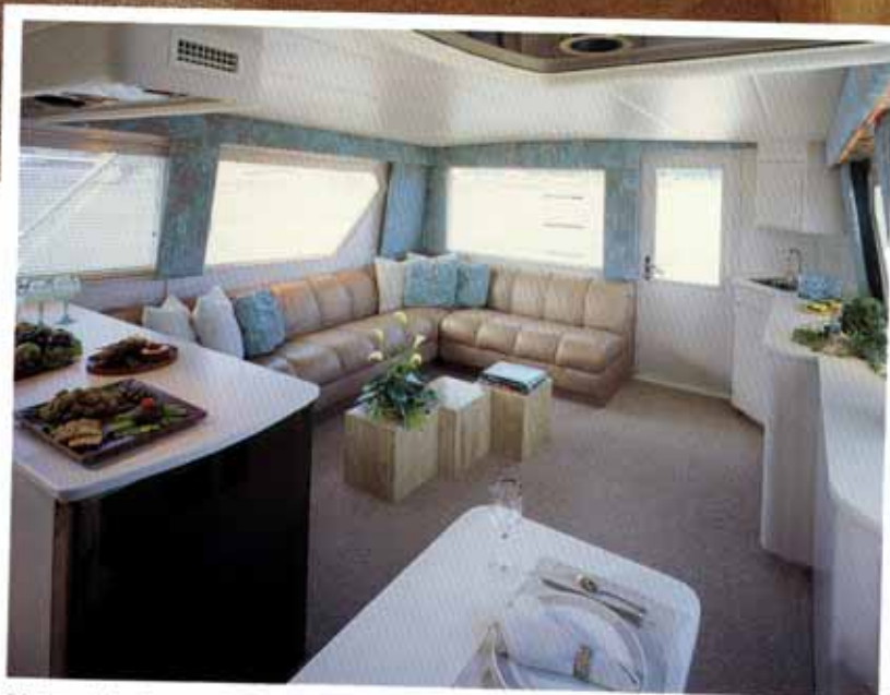
Pictured is the galley looking aft toward the salon. With two interior woods to choose from (optional ash or the standard afromosia) the "one great room effect" is totally relaxing. The entertainment center includes a single remote control for the TV, VCR, and AM/FM cassette stereo system.