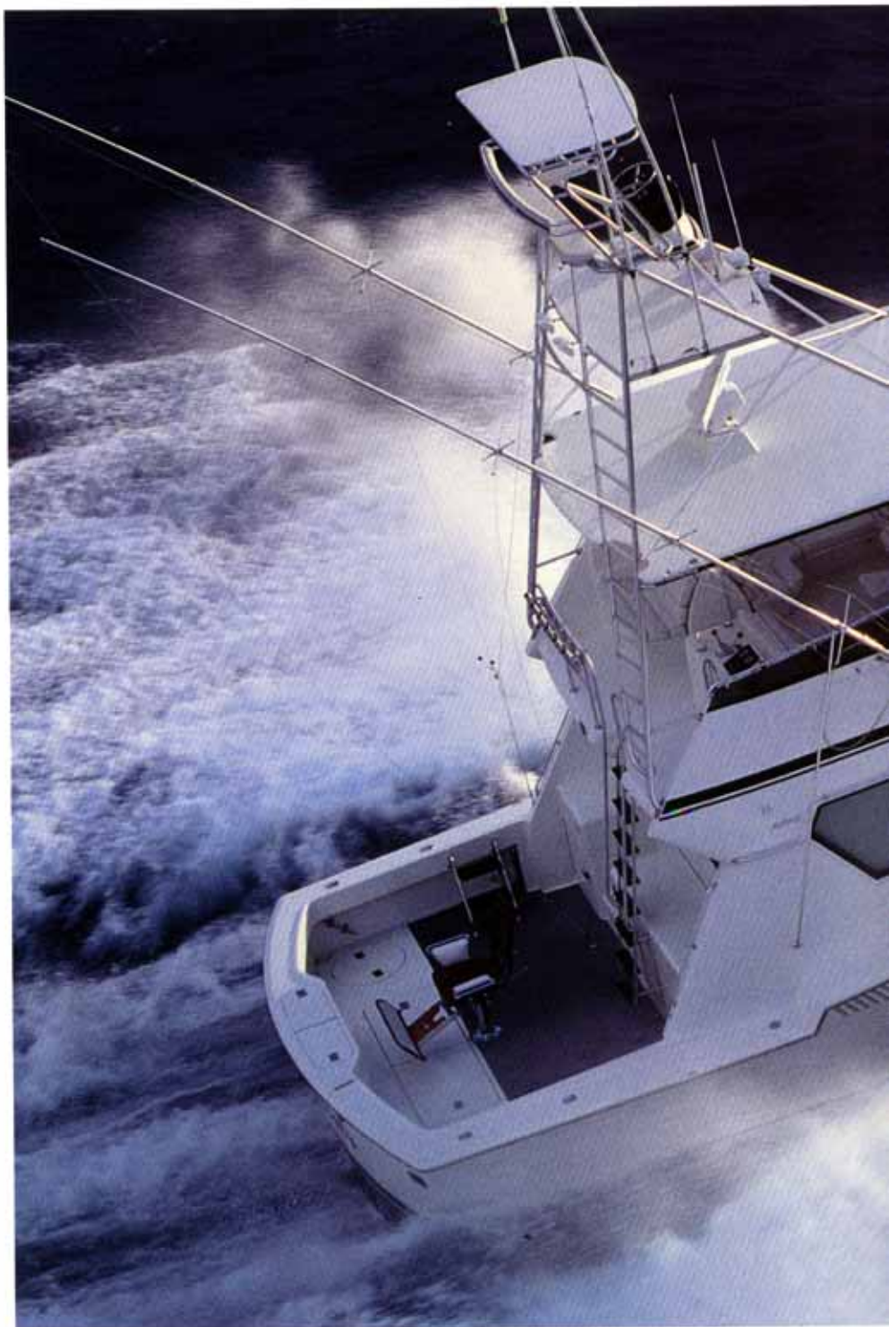
You can feel the power of the new 58C. The fully rounded brow of the bridge makes for a more contemporary look — and there's excellent visibility from the forward helm while underway.

There's an all-new bridge arrangement, too, and you have the Hatteras only option of having it completely enclosed and air-conditioned. There are two helm stations: a cruising helm station