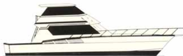
Optional Enclosed Flybridge