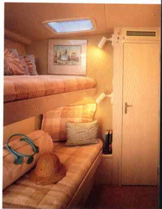
The third stateroom, for guest or crew, offers large, proportioned upper-and-lower berths, and uncommonly spacious storage. It has its own private head with stall shower, which also can become your day head.