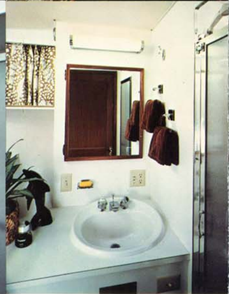
Bow stateroom's head and stall shower.