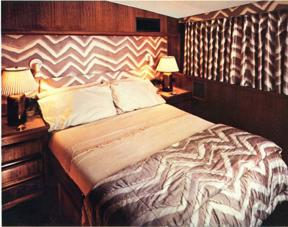
Master Stateroom looking aft toward queen-sized berth.