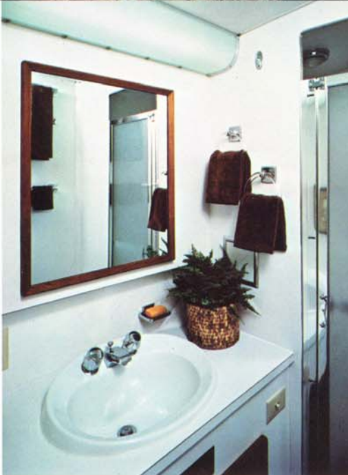
Master Stateroom's head with stall shower and large, mirrored medicine chest.