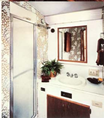
Guest stateroom's head with roomy stall shower.