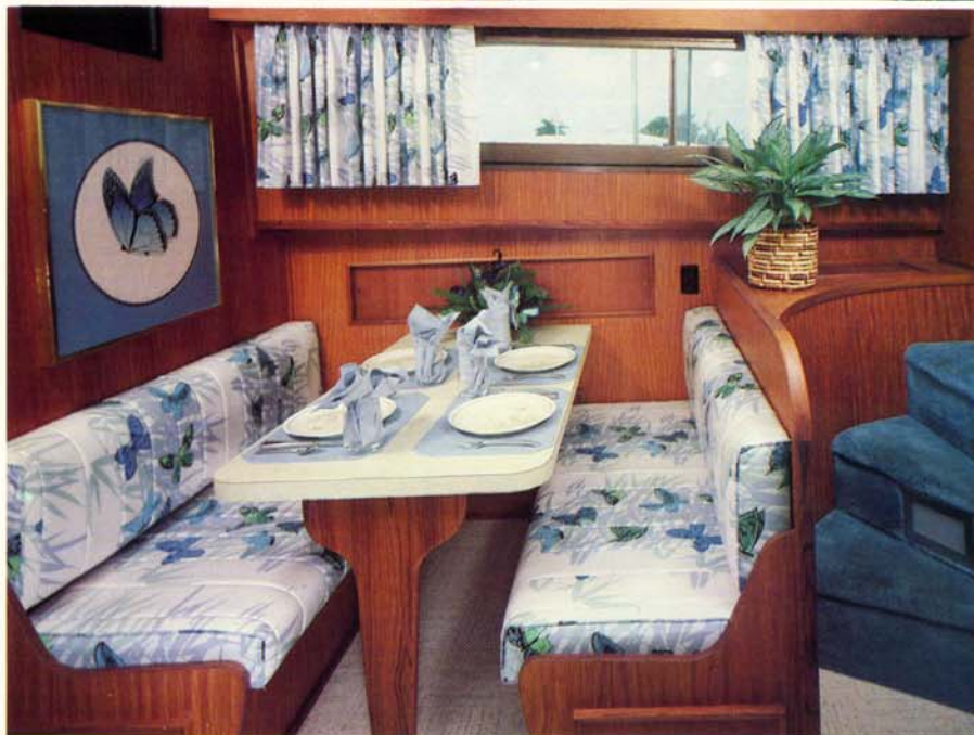
Dinette, thoughtfully placed adjacent to galley. Seats four adults in upholstered comfort. Hideaway storage.

A second reason is the efficient use of space you've come to expect from Hatteras. From extra stateroom lockers and dressers to a hatch in the galley's counter-top which turns a hard-to-reach corner into an easy access storage bin.