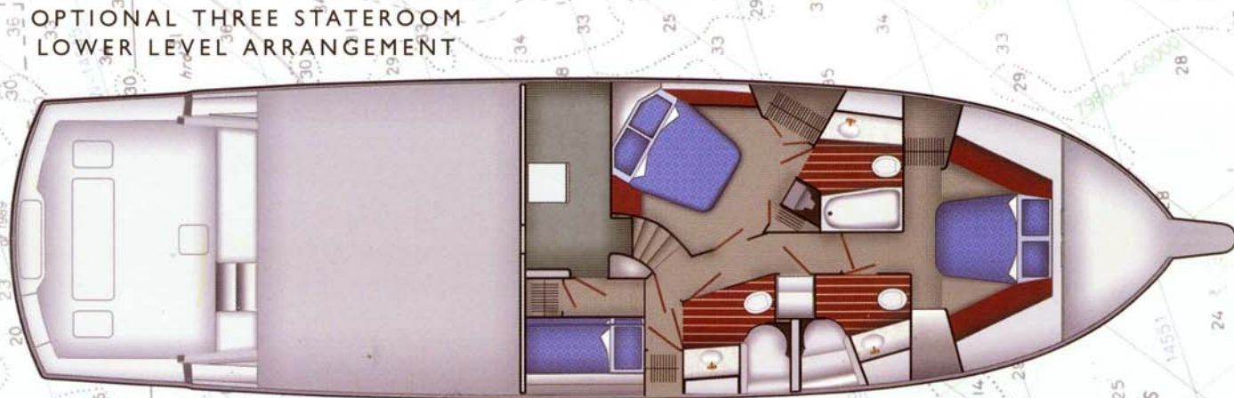
OPTIONAL THREE STATEROOM LOWER LEVEL ARRANGEMENT

H atteras' rebirth of the ever popular 65 Convertible will hit the tournament circuit in summer, 2000. The 65 Convertible has always been touted for its superior sea keeping hull, providing speeds of 35+ knots, coupled with a soft, dry ride. Features include rounded edges, a sleek raised foredeck with a swept back exterior profile. Its contemporary exterior provides new frameless windows with recessed pilasters, powder-coated exterior grab rails and welded stainless steel bow rails.