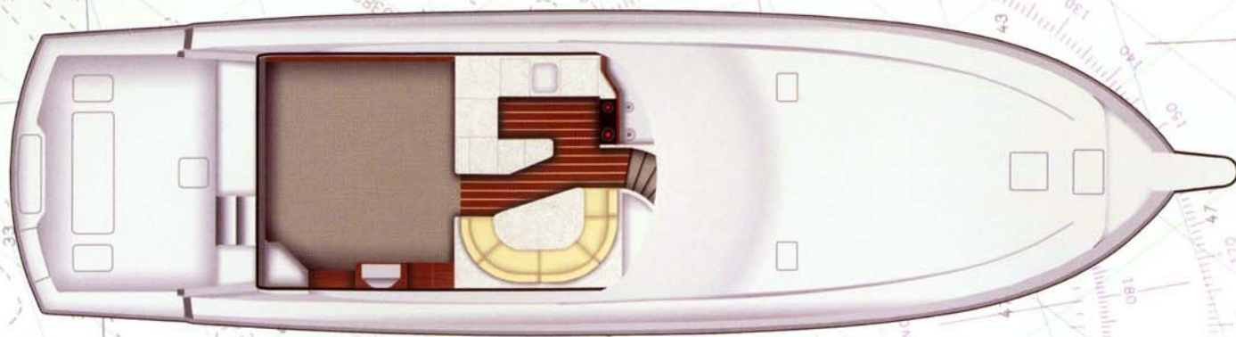
STANDARD UPPER LEVEL ARRANGEMENT