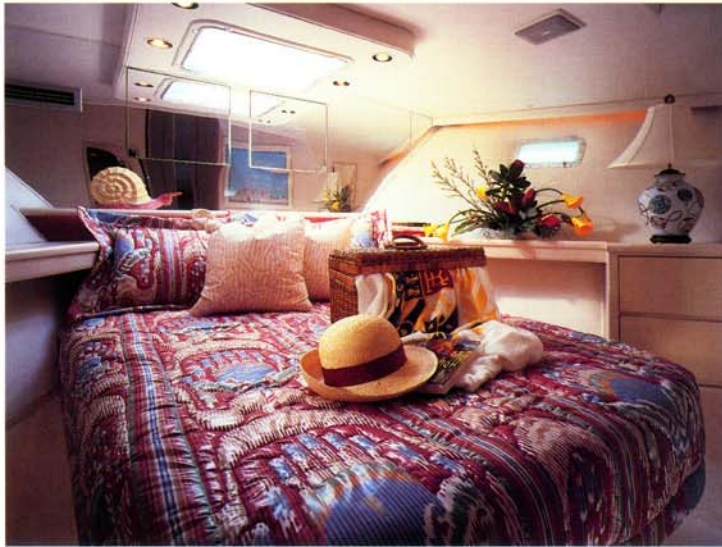
The bow stateroom has a tapered queen-size berth with ample storage and locker space; the forward port stateroom has full-length upper and lower berths.