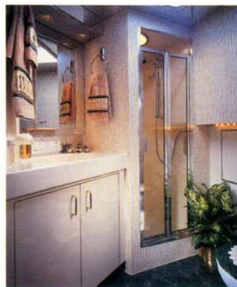
The private VIP guest stateroom head features a whirlpool bath and shower. The port and starboard forward heads (shown here) include stall showers.