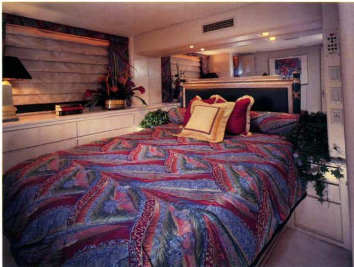
The VIP guest stateroom midships is a mini-master stateroom, with tapered queen-size berth, with built-in dressers, nightstands, and a cedar-lined hanging locker.